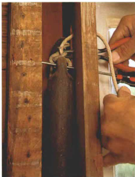
Changing cords. We pulled this window's casing to reveal the delicate operation. The sash weight is secured with a screwdriver as the old knot is unraveled using needle-nosed pliers.

can be removed from the sash-side of the window. Cheaper pulleys are often press-fit into the jamb and secured from behind with a pin. They are typically serviced by removing the side casings.